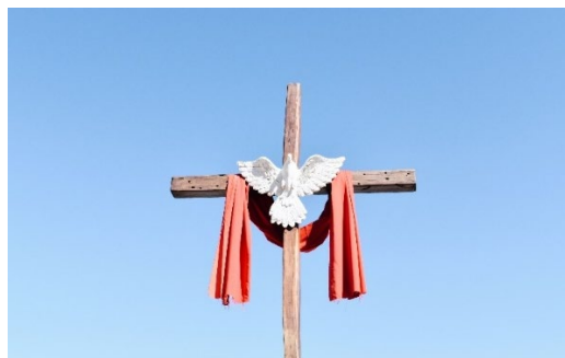
Photo by Emily Crawford on Unsplash. emily-crawford-rsfj8DspwoA-unsplash.crucifixion.dove

Wallace warns of a “permanent trauma to the divine life itself.” This happens through the crucifixion-like ecocide that humans inflict upon Earth and its inhabitants (129). He equates God’s suffering through Jesus on the cross with God’s suffering through the embodied Spirit in Earth. Wallace hopes for “a conversion of the heart to a vision of a green earth, where all persons live in harmony with their natural environments.” Further, he urges us to “work toward a seamless social-environmental ethic of justice and love toward all of God’s creatures” (136).