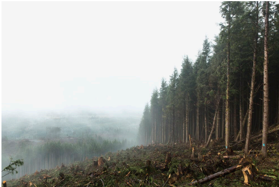
The border between clear cut operations and the Ellsworth Creek Preserve, Washington.

https://www.washingtonnature.org/fieldnotes/setting-path-natural-climate-solutions-in-washington