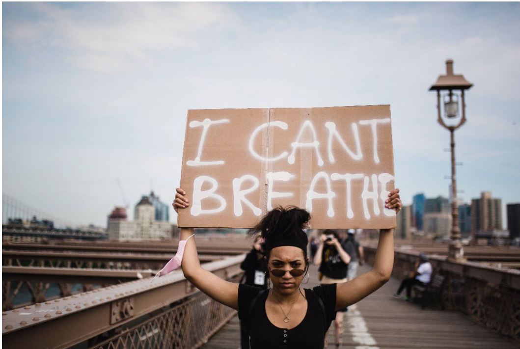
I Can't Breathe.