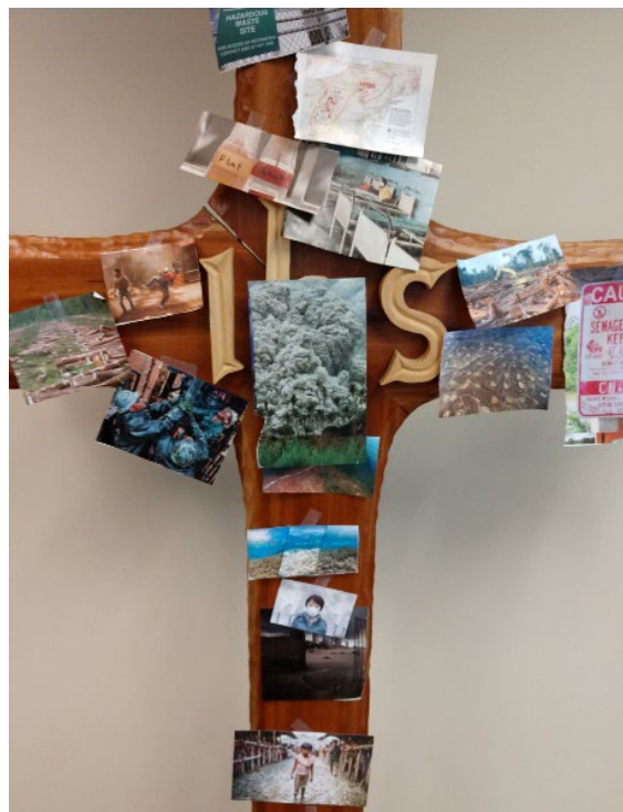
Eco-crucifixion, close-up.