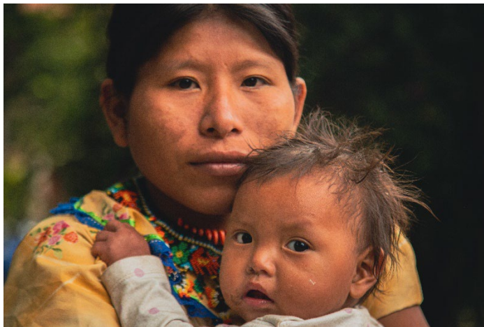
Mother and child in Bogota, Colombia.