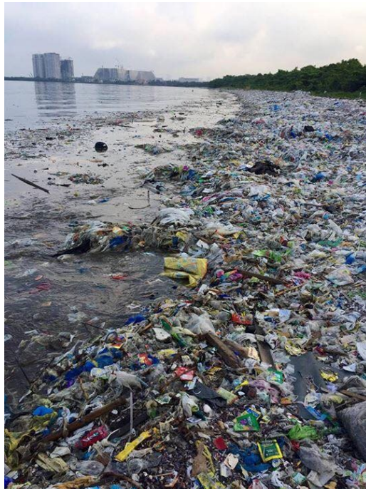
Plastic trash in the ocean. Photo by Dianna Cohen in Manila, Philippines.

https://www.facebook.com/oceandefender/photos/a.330811539652/10154462558344653/