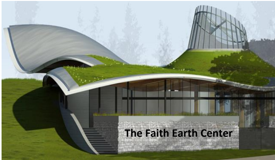
The Faith Earth Center